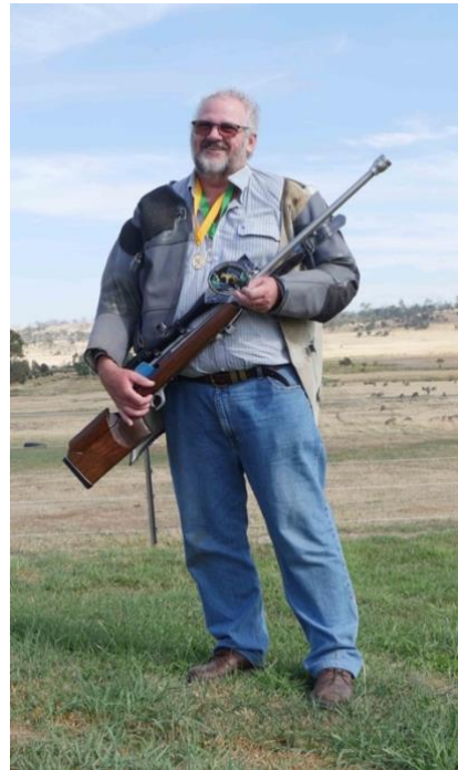
Tasmanian MR champion 2023